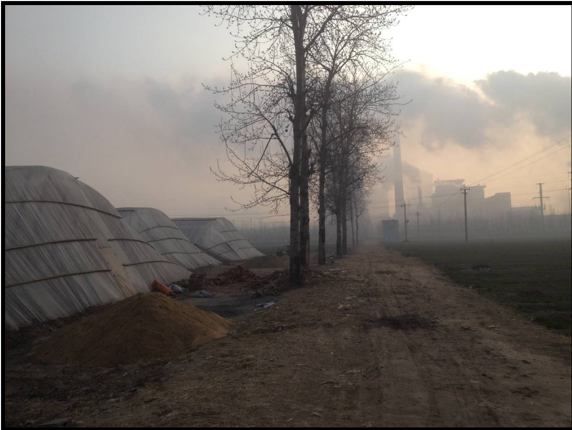
Luli Steel smelter dust on vegetable greenhouses near the plant

There is a railway running into the industrial park and a garbage zone more than 300 meters in length on one side of this railway. On the other side is a dump of cinder allegedly from the steel mills. Filled with wastewater, Zhangseng River flows beside the industrial park. Beside this river,