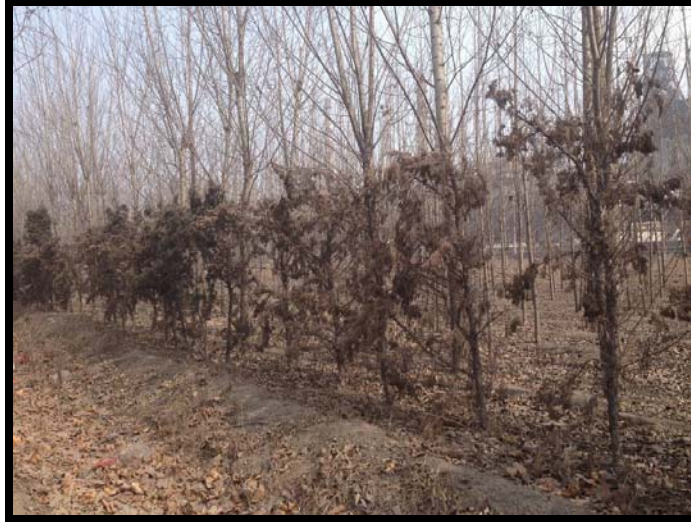
Dead trees outside the Luli Steel smelter