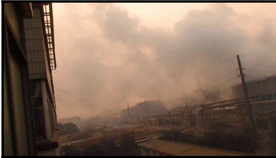
View of Lianmeng Chemical across the street from a residential apartment window