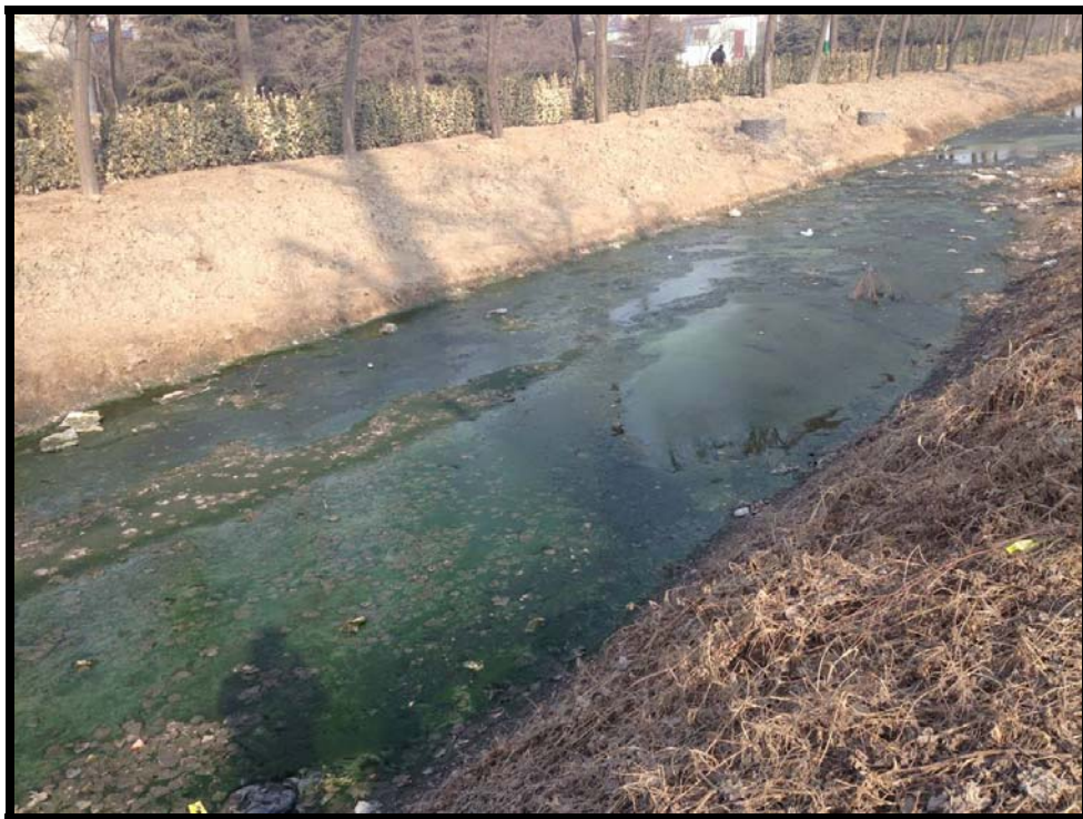
Waste from Juneng Steel Corp contaminates irrigation canal for crops; photo by Wang Chunsheng