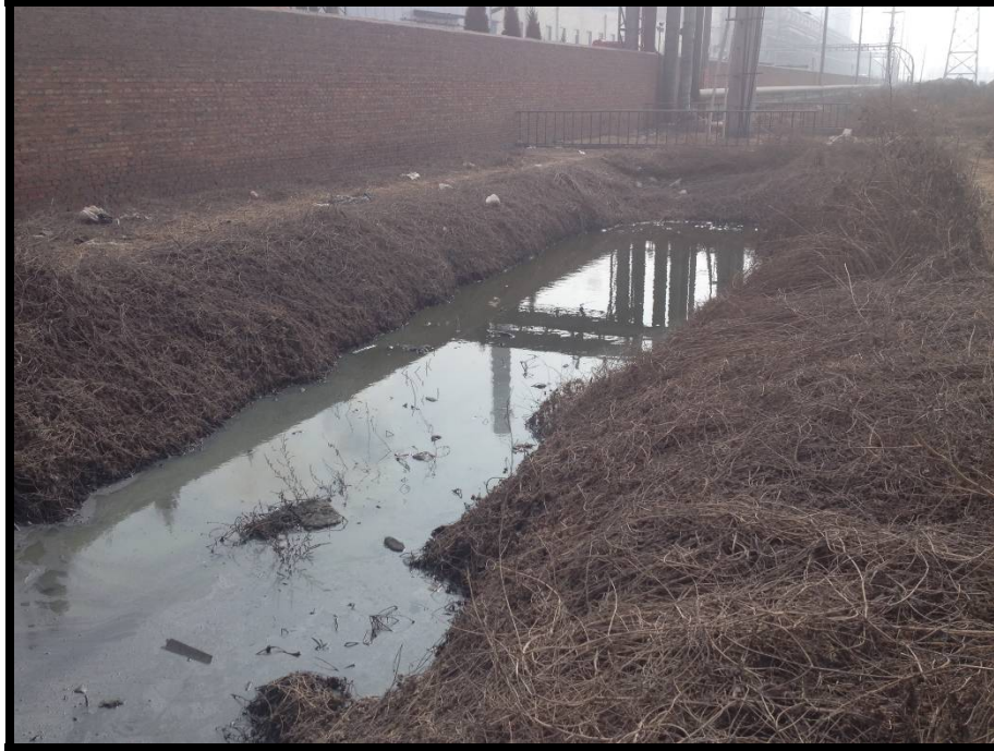
Wastewater released by Luli Steel smelter