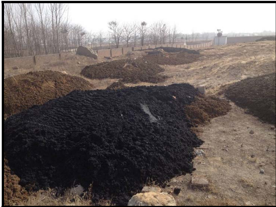
Luli Steel smelter waste dump