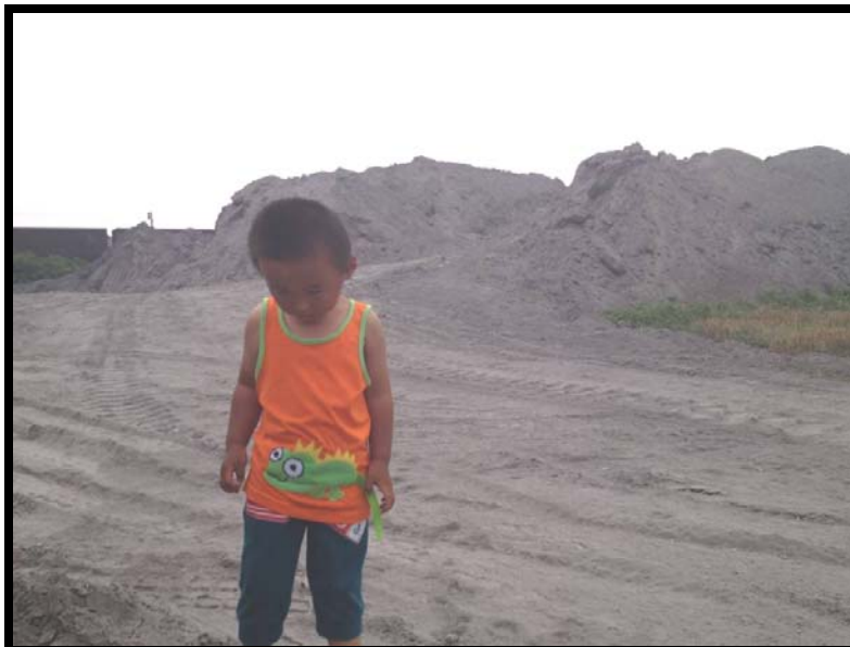
Boy plays in Lianmeng Chemical waste dump