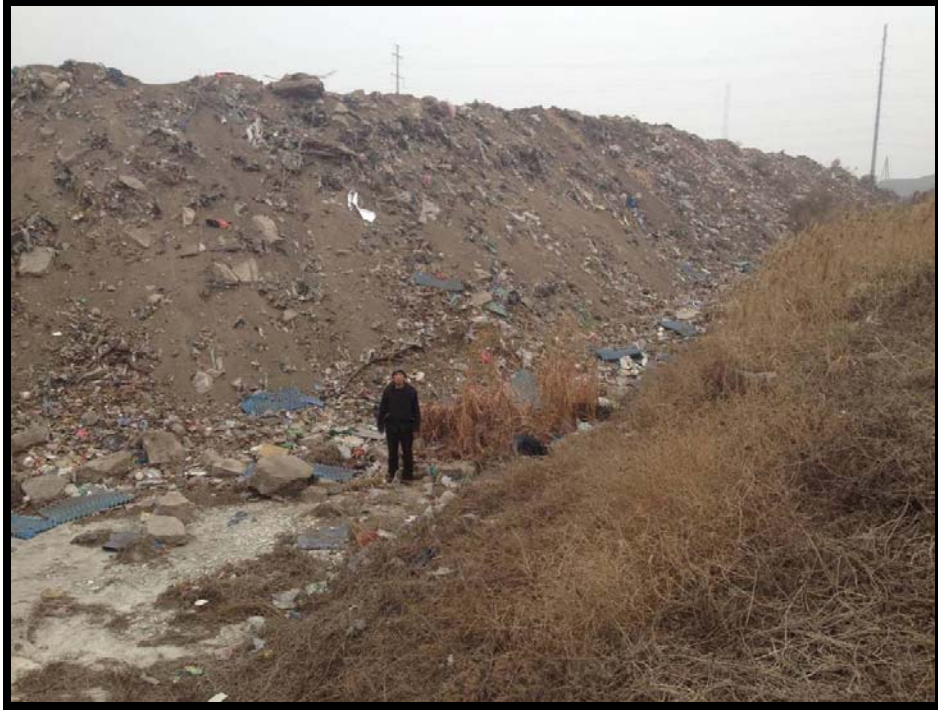
Gigantic waste pile from Juneng Steel Corp