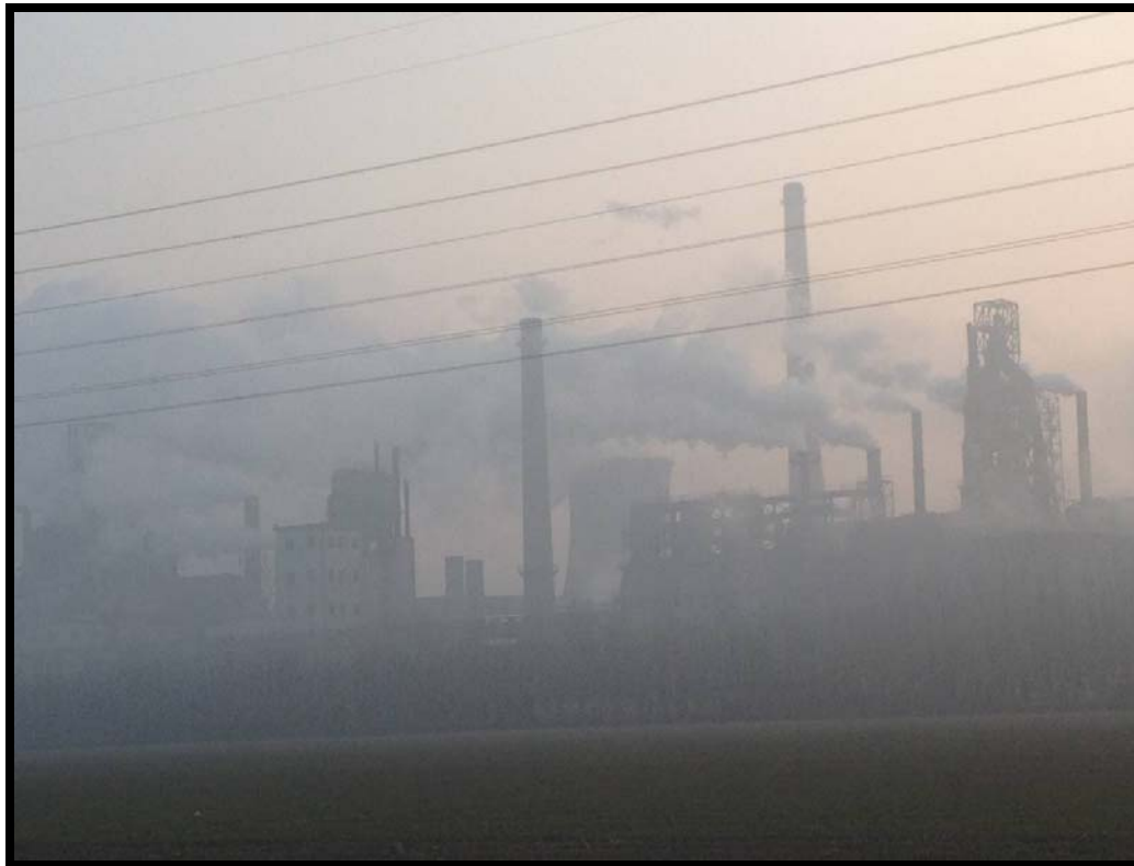
Luli Steel smelter; photo by Wang Chunsheng