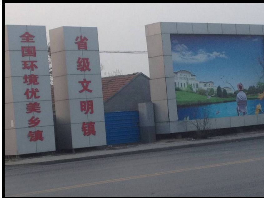
In Hou Town, Luli Steel is honored for its environmental stewardship; photo by Wang Chunsheng

a buried sewage pipe runs to a sewage treatment plant in Yangkou Town. We sampled wastewater from within a sewer. It was pink. There was a sign less than three kilometers away from the industrial park, that reads, “Level 1 Protected Source of Drinking Water”. But here we could still smell garbage.