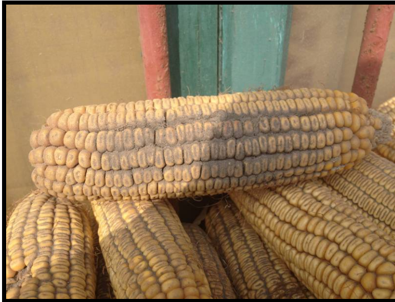
Luli Steel smelter pollution falls on corn; photo by Wang Chunsheng

We then visited Chenming Industrial Park, which surrounds a village and brings local villagers more polluted air and water than business opportunities. This industrial park has caused a one third reduction in crop yields, according to local villagers. Green spaces outside the walls of these plants are very wide. In addition to landscaping, these spaces serve as a good cover for waste dumping – and there are sewers behind trees. Less than one kilometer from here is a waste pit, which is being dealt with by the local environmental authority after it received a report from Wang Chunsheng. But we do not know where these wastes will be shipped.