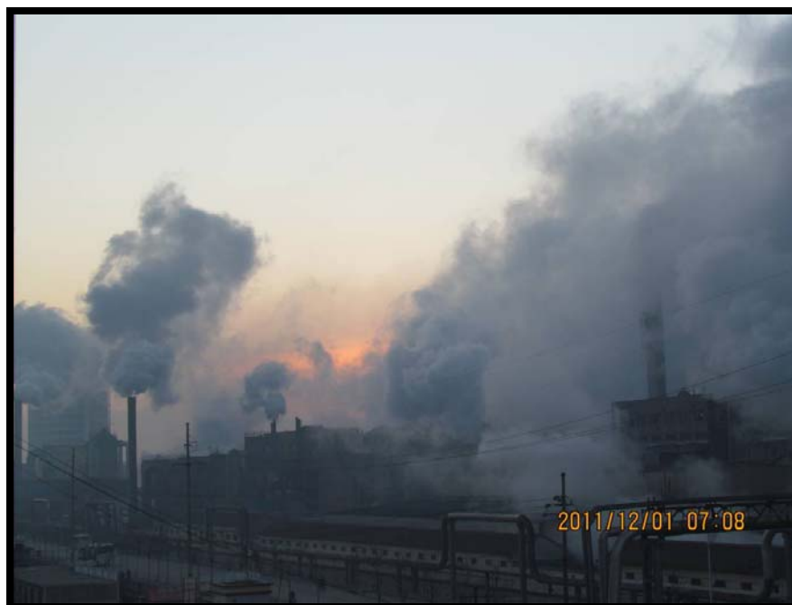
Lianmeng Chemical

Shandong Province is a key region for economic development in China. The Province is a major agricultural production base, contains the second largest oil field in China, and operates one of the top ten coal mines in the country. 1 In addition, Shandong has been the leading province in China for the chemical industry for the past 20 years and reached 1.95 trillion yuan in sales in 2011 – 17% of China's entire chemical industry revenue. 2 In 2013, Shandong Province contained more than 150 development zones including 137 provincial level zones along with 13 state level economic and technological development zones, and three export processing zones, among others. 3