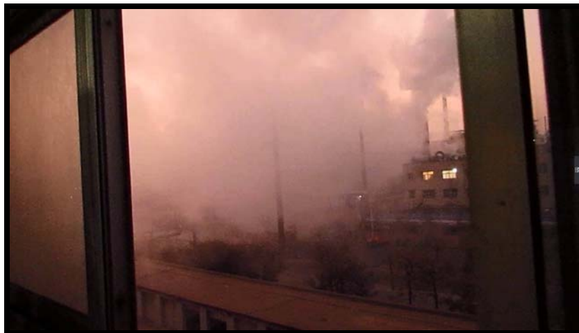
View of Lianmeng Chemical across the street from a residential apartment window

The Lianmeng facility grew to occupy over 40 hectares and produce approximately one million tonnes of urea per year among other chemicals. One problem with Lianmeng’s operation was its location in the middle of residential housing on rented land. For example, Wang Chunsheng lived in Houzhang Village across the street from the facility. Wang took the pictures above and below by looking out his window.