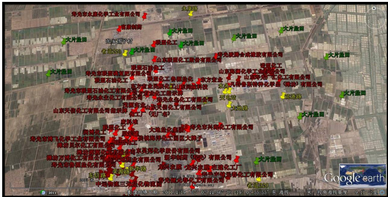
Heavy concentration of industrial parks in Chahe Town of Shouguang County; Image produced by Wang Chunsheng