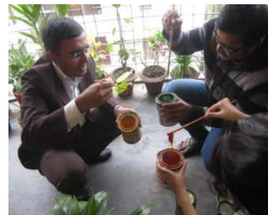
Taking paint samples.

EARTH conducted a paint survey in more than 10 provinces across Thailand in collaboration with the Foundation for Consumers. A total of 30 manufacturers were found, producing 88 different brands of enamel paint. 125 of these paints will be analysed for lead content.