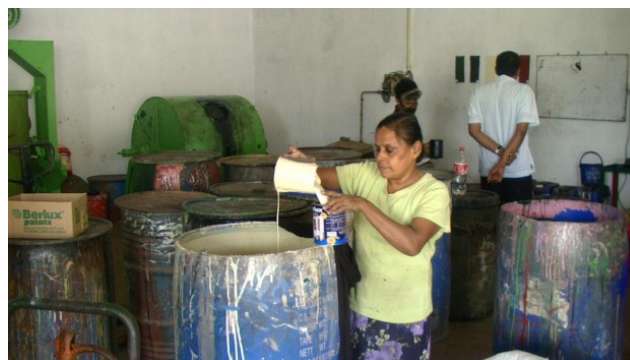
Workers in a Sri Lankan paint factory work with out any personal protection.

The Disease Control Department under the Ministry of Public Health also has welcomed the campaign, and plans to join the national working group