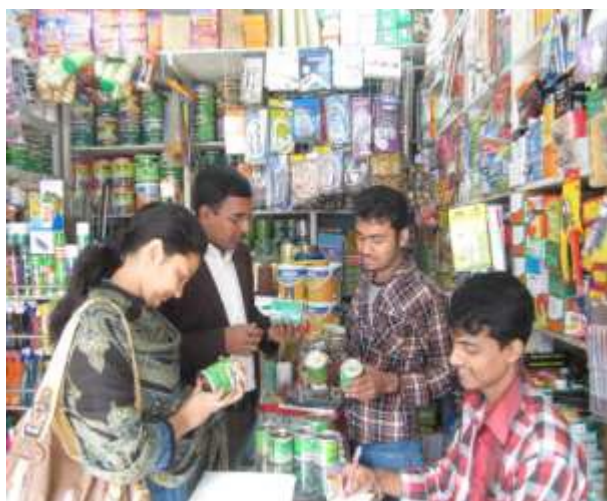
Surveying paint brands in a local store in Bangladesh

Female project staff at CEJ have encountered additional resistance because it is very unusual for women in Sri Lanka to inquire about paints