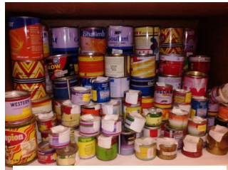
Variety of paints for sale in India

The Philippine Association of Paint Manufacturers has expressed interest working with EcoWaste Coalition on a certification program.