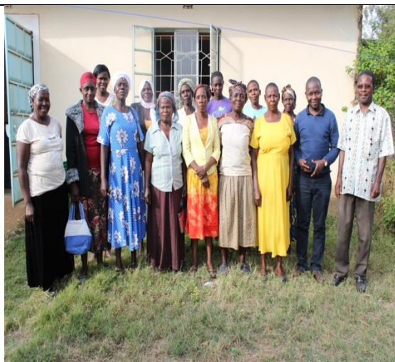
Photo 7: CEJAD team with members of MOKA group