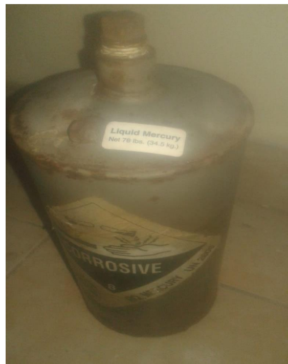
Photo 1 & 2: 250ml bottles where mercury and picture of large bottle of mercury