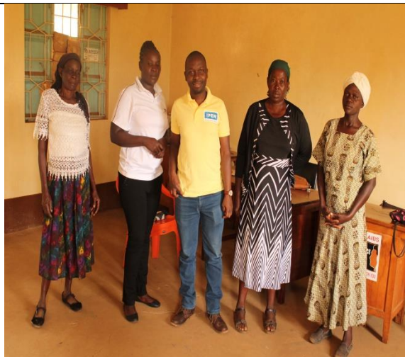
Photo 5: CEJAD's Griffins pose for picture with MOKA officials, photo credit: CEJAD