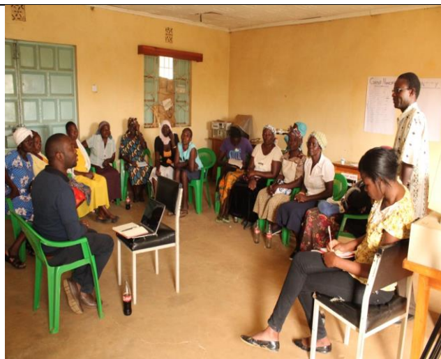
Photo 6: CEJAD team at a sensitization for women miners