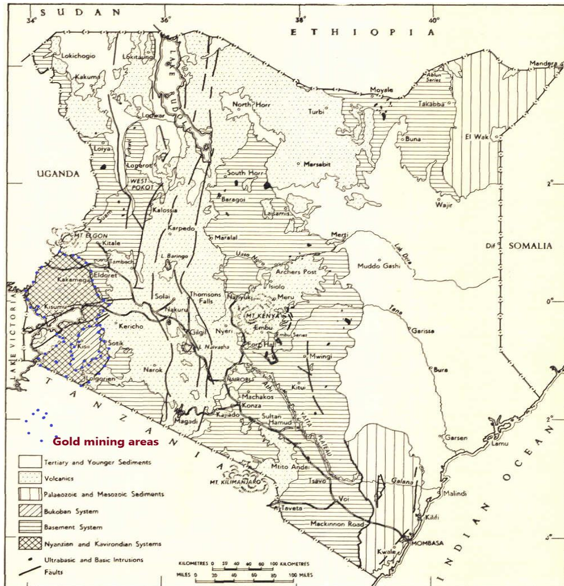
Figure 1 Geology Map of Kenya