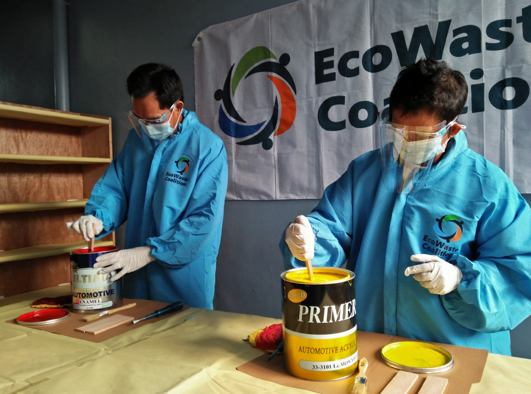
Figure 1. Sample preparation conducted by researchers of EcoWaste Coalition.

laboratory selection process, IPEN further assessed the reliability of the laboratory results by conducting an independent quality assurance testing. This was made by sending paint samples with a known lead content to the laboratory, and evaluating the results received.