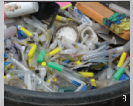
8. A bin of used syringes and other healthcare waste from a Thai hospital