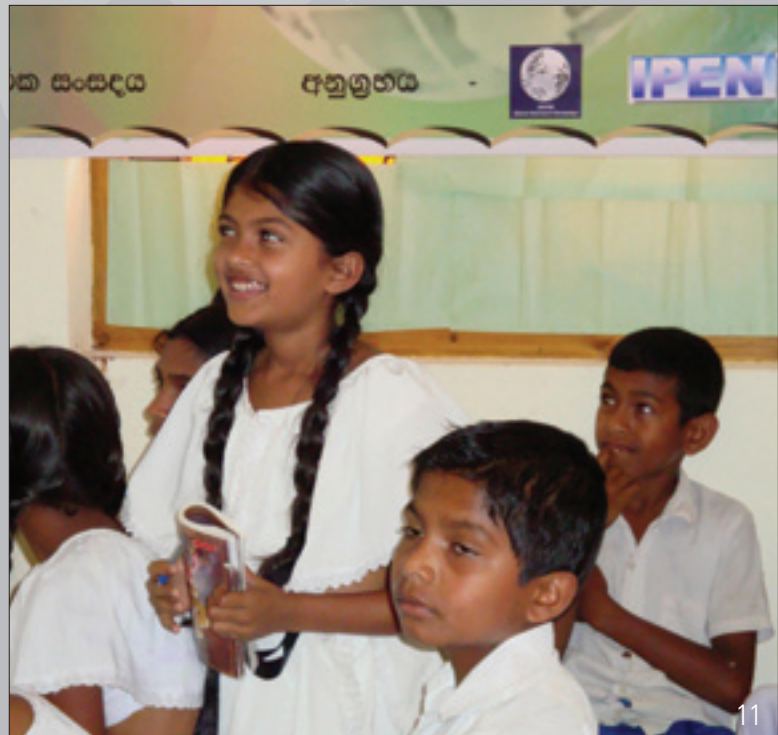
11. Students in Sri Lanka learn about chemical safety.