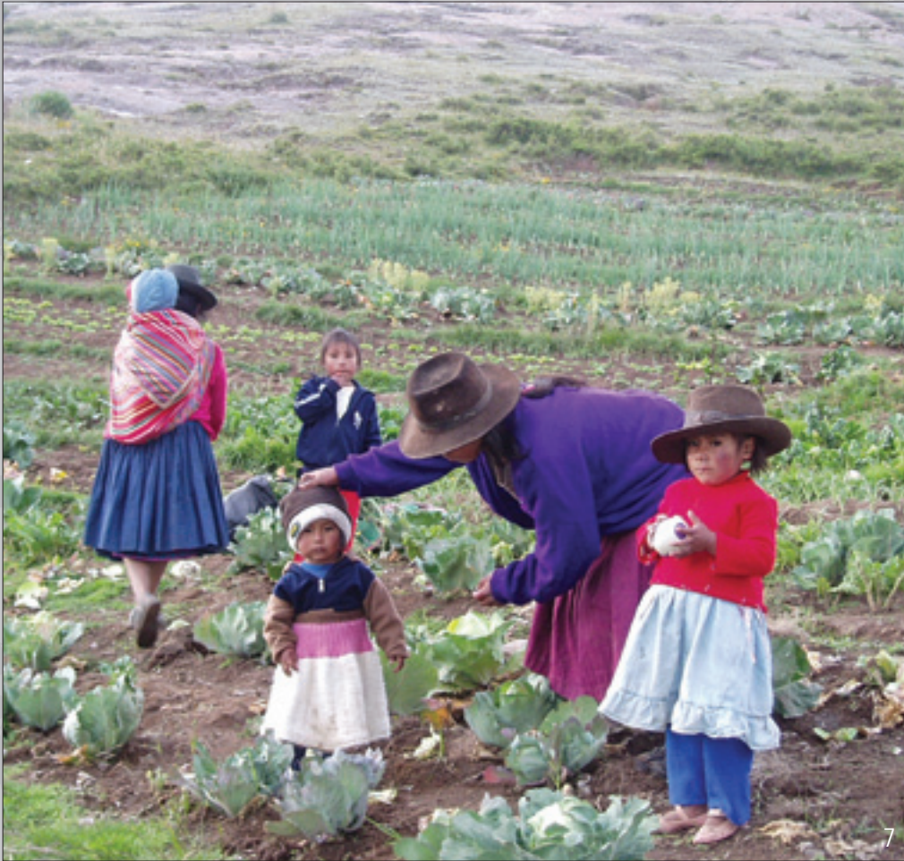
7. In rural areas, the relationship between the farm land and community is very close, thus exposure of hazardous pesticides also threatens families living on the land and in the agricultural environment.