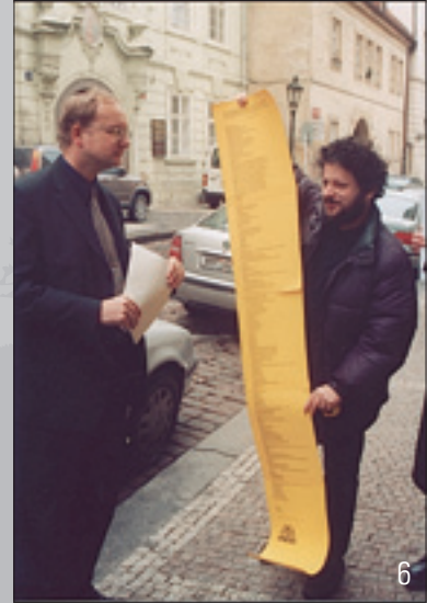
6. ARNIKA from the Czech Republic illustrates for decision-makers a long list of public support for chemical safety.