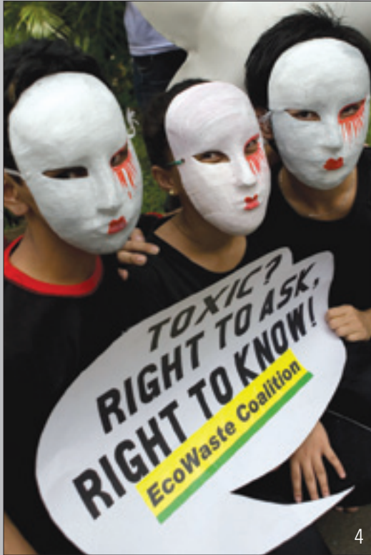
4. Campaigning for the consumers' right to ask and right to know.