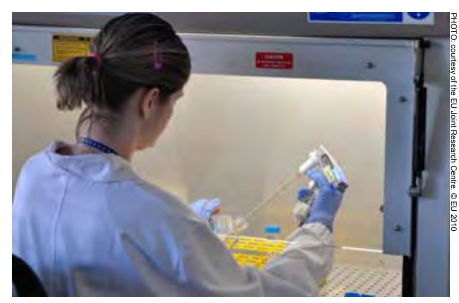
The vision of TT21C: from in vivo tests to high-throughput in vitro tests.

In the history of science, new ideas tend to take over only when they have been acknowledged by the scientific community as having value. They become the new paradigm once enough evidence has been collected to show they have more validity than the older ones. The concepts behind TT21C have received widespread coverage in numerous presentations at conferences and in papers in scientific journals. They have received support from toxicologists in regulatory agencies, academia and industry